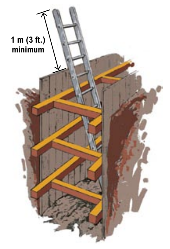
This is an example of ladder use in an excavation over 1.2 m (4 ft.) deep.

The ladder must extend from the bottom of the excavation to at least 1 m (3 ft.) above ground level and be placed so that it is protected by the shoring.