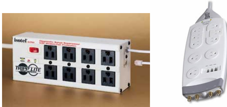
Figure1. Multiple Outlet Surge Protectors

applications, with higher wattage, are not to be connected, such as photocopiers, space heaters, microwave ovens, and refrigerators. Always verify the limit allowed before its use.