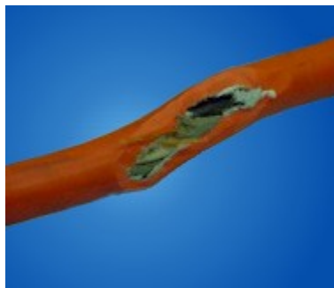
Figure3. Damaged Electrical Cord