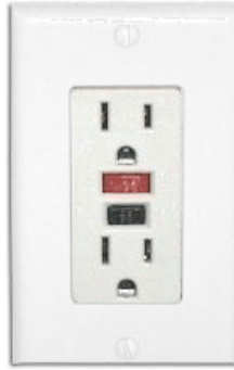
Figure2. Ground Fault Circuit Interrupter (GFCI)

It is important to note that GFCIs are subject to wear and therefore damage over time. For example, GFCIs may undergo damage due to a strong power surge during an electrical storm. Therefore, GFCIs should be tested regularly. The recommended frequency is once every month.