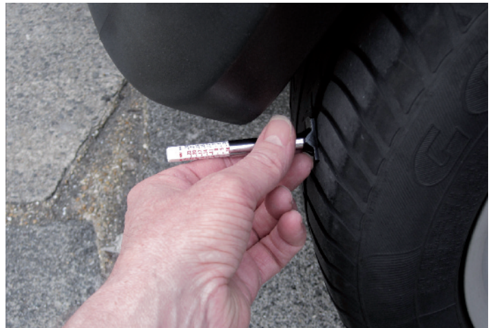
The minimum legal tread depth for a car tyre is 1.6mm.

We recommend regular checks of tyre condition and pressure in line with your manufacturers recommendations to prolong the life of your tyres and improve vehicle safety.