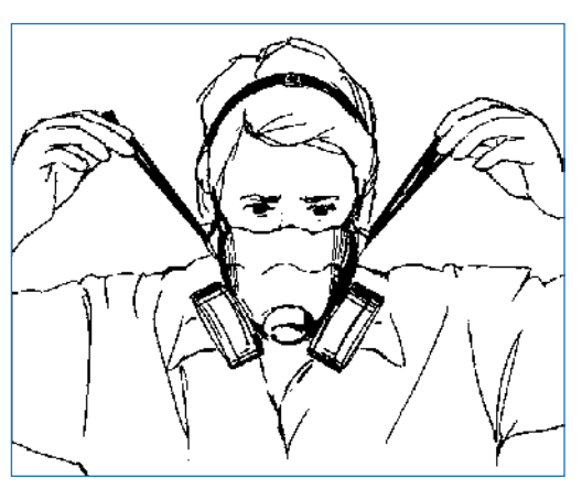
2. Grip straps and tighten