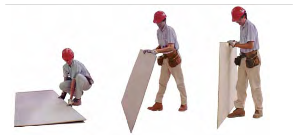
Bend knees, keeping back as upright as possible.

Demonstrate how to lift sheet material off the floor.