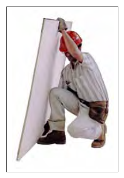
Bend at knees, keeping back upright. Slip free hand under sheet.

Use a carrying handle to move sheet material a distance.