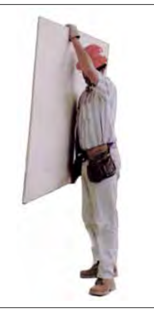
Stand and lift, maintaining the normal curve in your lower back.