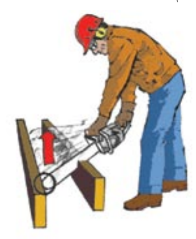
The examples above show how kickback can occur.

Take extra care when making pocket cuts. Start the cut with the underside of the chain tip, then work the saw down and back to avoid contact with the kickback zone. Consider the use of a sabre (reciprocating) saw to make pocket cuts.