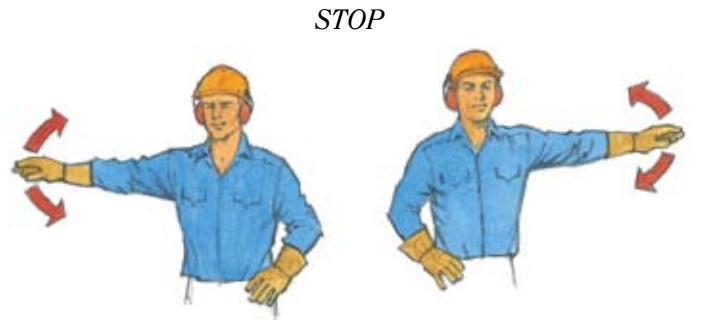
Arm extended, palm down, move hand horizontal.

If hand signals are used between a signaller and the operator of a tower crane to control hoisting operations, the following signals should be used: