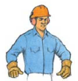
Both fists in front of body, with thumbs pointing toward each other.