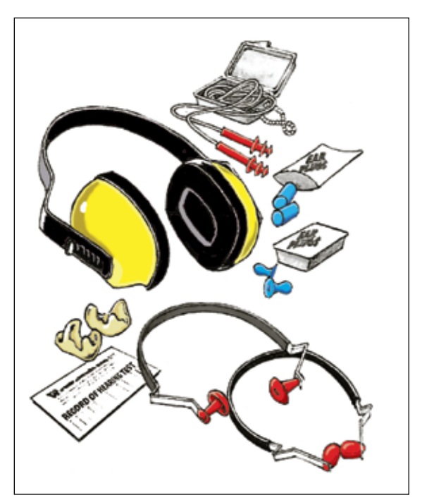
There are many options for hearing protection on a construction site.