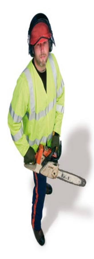
Figure 2 PPE

PPE should only be used as a last resort, ie when all other ways to eliminate or reduce risks have been considered.