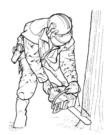
Figure 4 Bracing the forearms