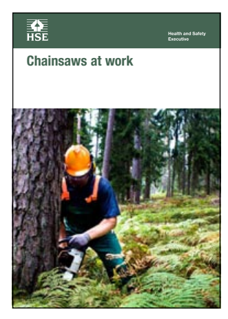
This is a web-friendly version of leaflet INDG317(rev2), published 01/13