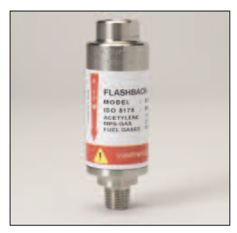
Model 6104A Series Flash Arrestor