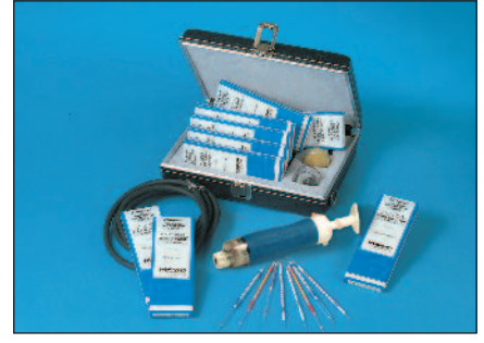
Model 8014KA Toxic Gas Detector Tube Sustem