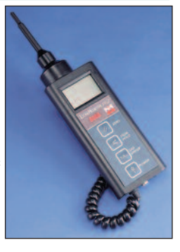
Figure 14 - Model 8066 LeakHunter Plus

Check cylinders and all connections under pressure for leaks prior to using the contents. When using toxic gases, it is advisable that some device be used to warn of the presence of toxic concentrations.