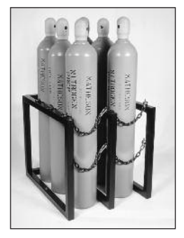
Figure 9 – Model 6530 Series Cylinder Storage Racks