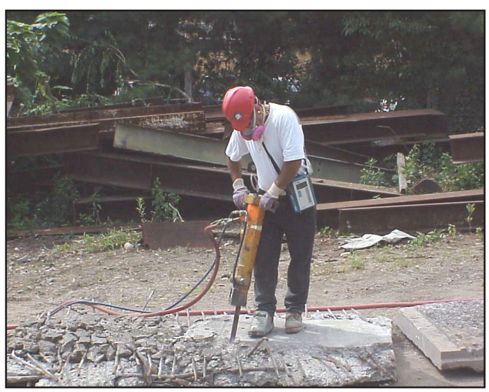
A worker chips concrete with a jackhammer using a water-spray attachment to control dust.

Use ground-fault circuit interrupters (GFCIs) and watertight, sealable electrical connectors for electric tools and equipment on construction sites. These features are particularly important in wet or damp areas, such as where water is used to control dust.